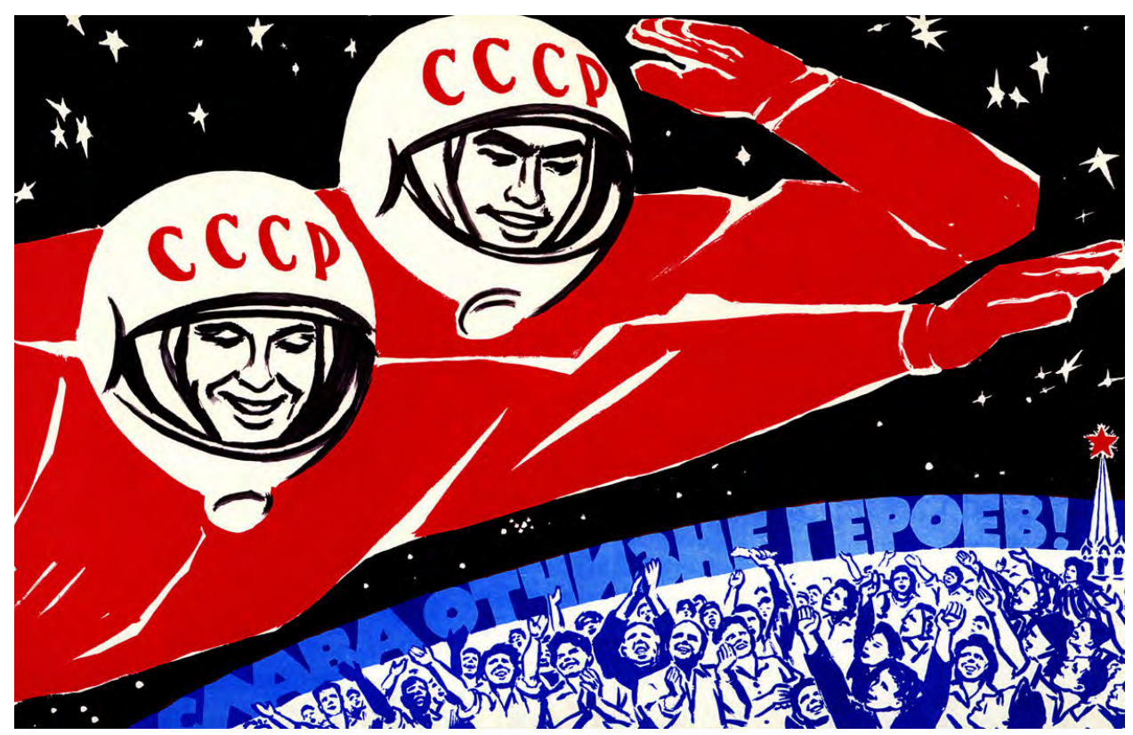
"Soviet Man, Be Proud. Glory to the Heroes of the Homeland!"