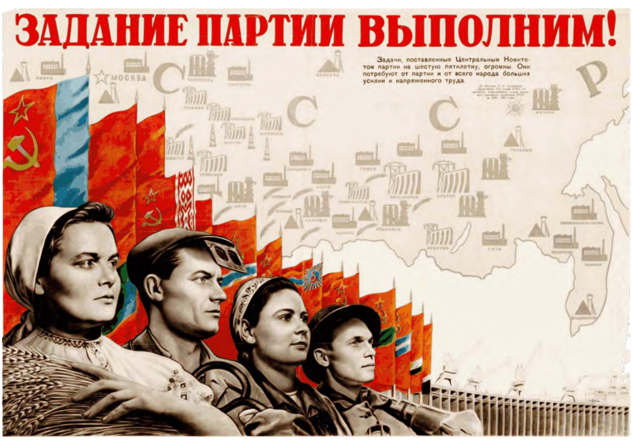
"We Are Fulfilling the Party's Tasks!"