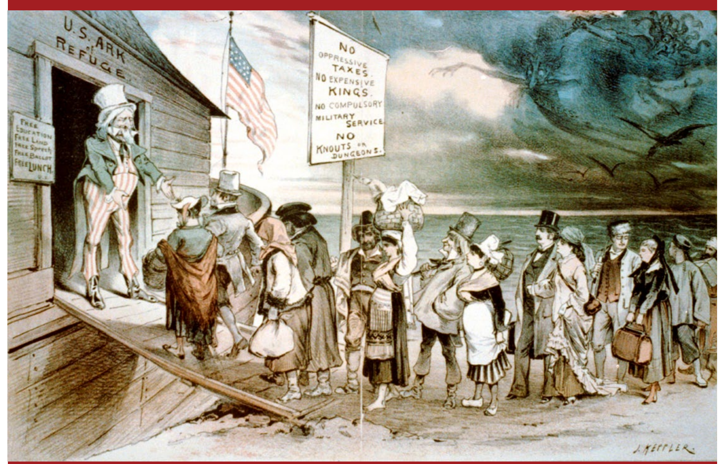
J. Keppler, "Welcome to All," Puck, April 28, 1880.