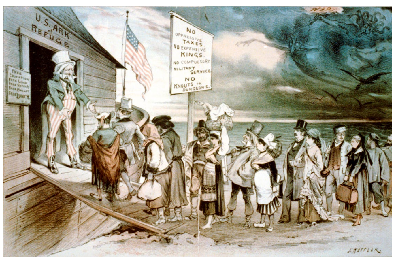
J. Keppler, "Welcome to All," Puck, April 28, 1880.