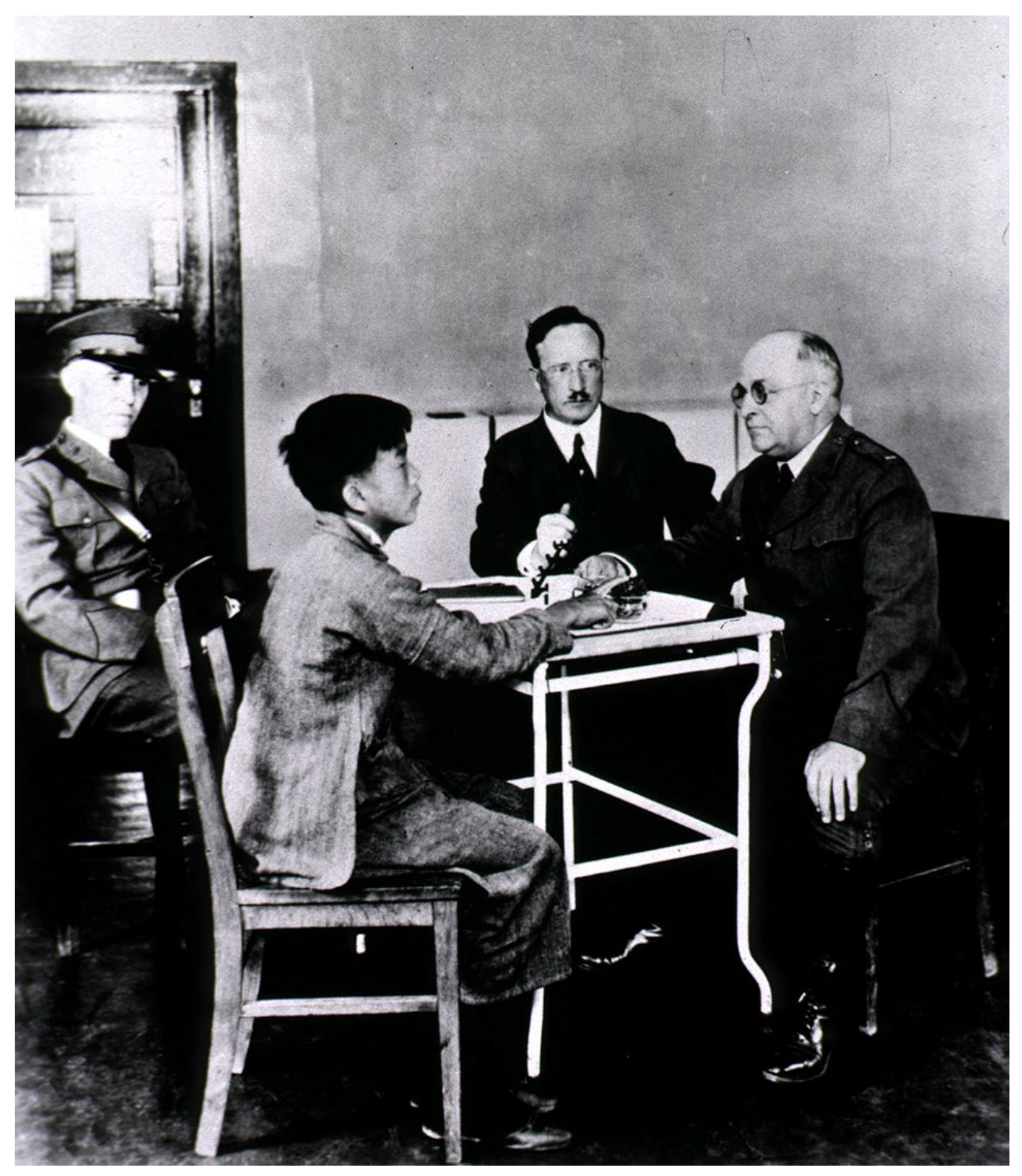
"Testing an Asian immigrant" at the Angel Island Immigration Station, San Francisco, 1931.