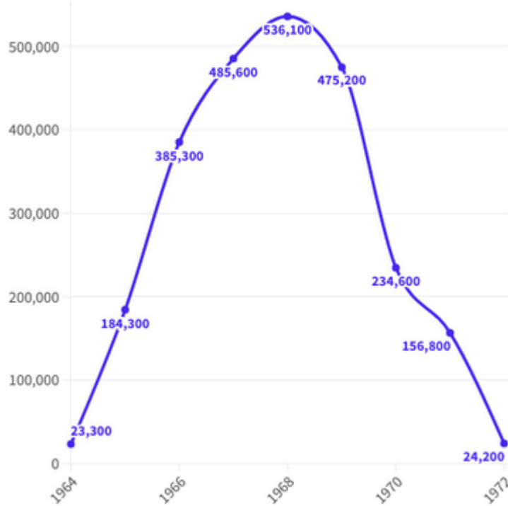
US Military Forces in Vietnam, 1964–1972