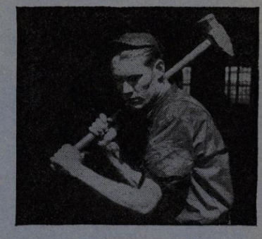
The REMEMBERED Man

-WILLIAM GREEN, President, American Federation of Labor Address before National Women's Trade Union League (May 5, 1936)