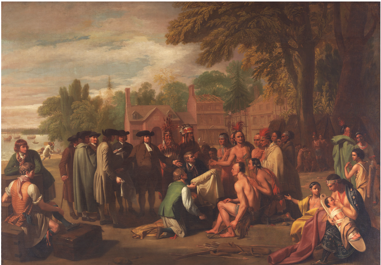
Pennsylvania Academy of the Fine Arts