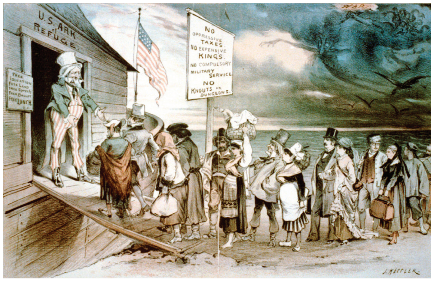
"Welcome to All," Puck, April 28, 1880.