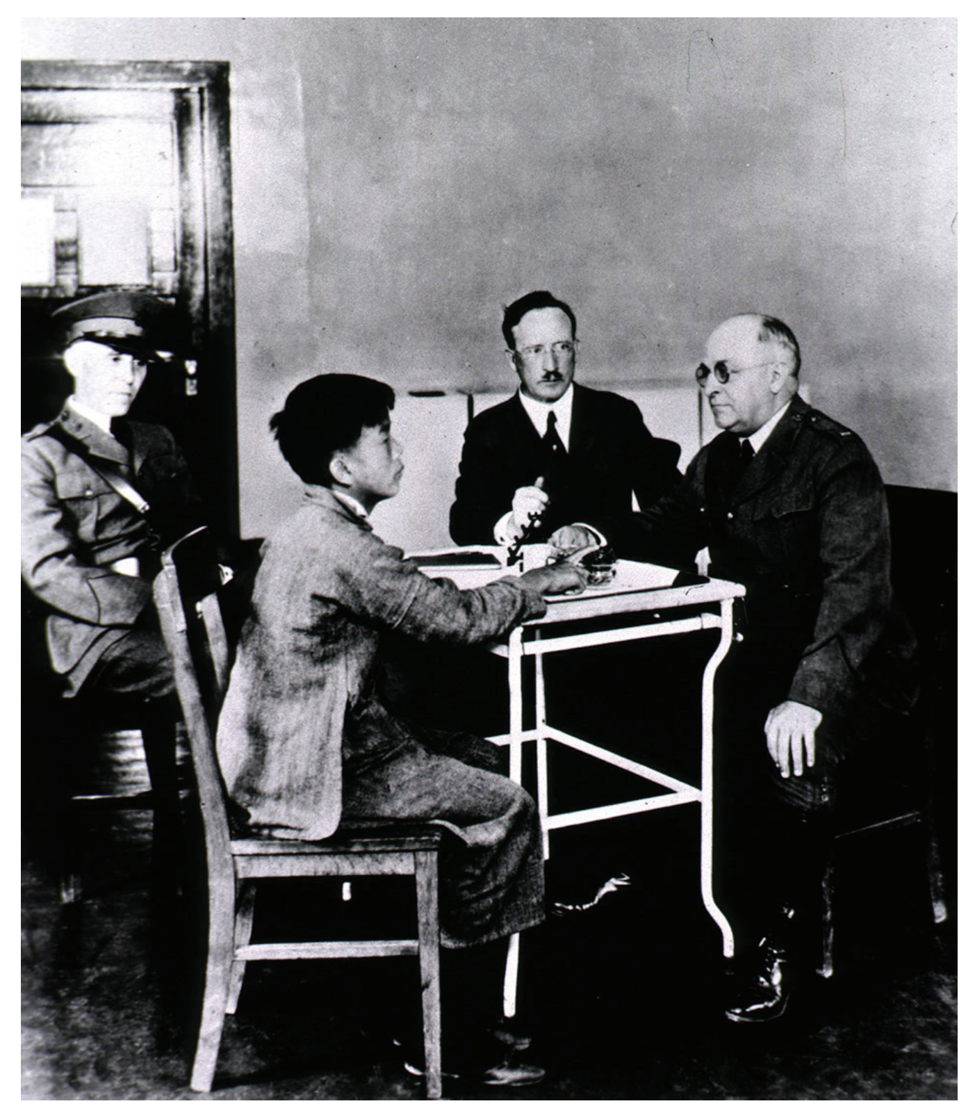
"Testing an Asian immigrant" at the Angel Island immigration station, San Francisco, 1931.