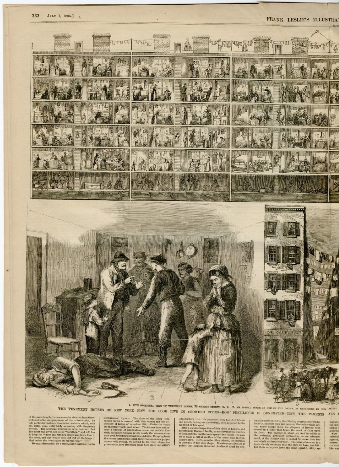
Frank Leslie's Illustrated Newspaper, No. 509, Vol. 20, July 1, 1865