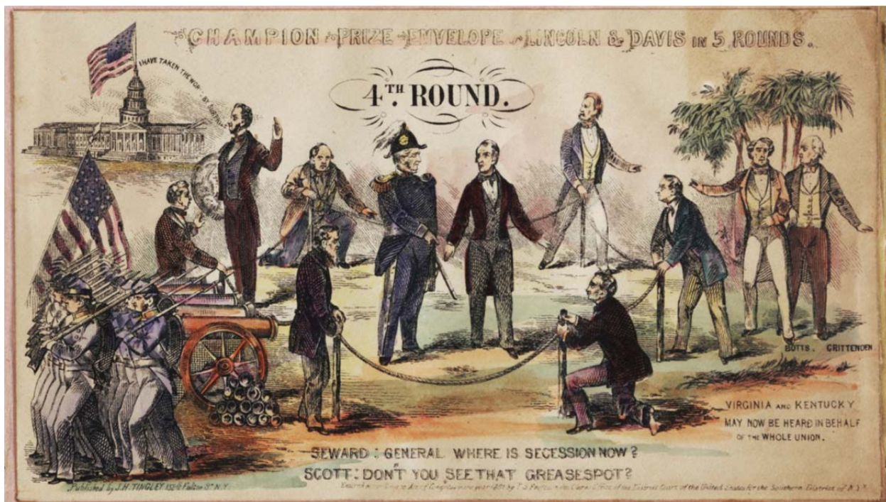
"Champion Prize Envelope – Lincoln & Davis in 5 Rounds. 4th Round," 1861