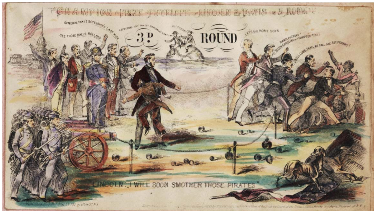
"Champion Prize Envelope – Lincoln & Davis in 5 Rounds. 3rd Round," 1861 (Gilder Lehrman Institute, GLC00496.017)