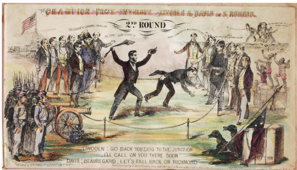
"Champion Prize Envelope – Lincoln & Davis in 5 Rounds. 2nd Round," 1861