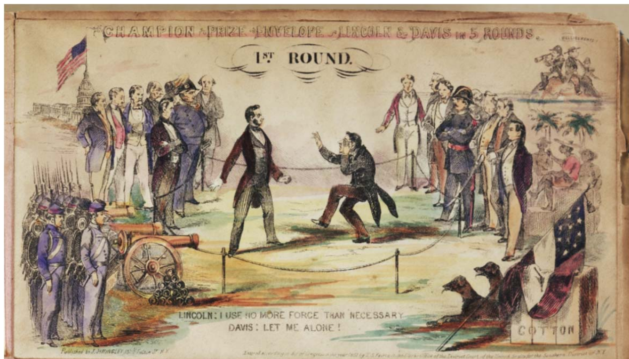
"Champion Prize Envelope – Lincoln & Davis in 5 Rounds. 1st Round," 1861