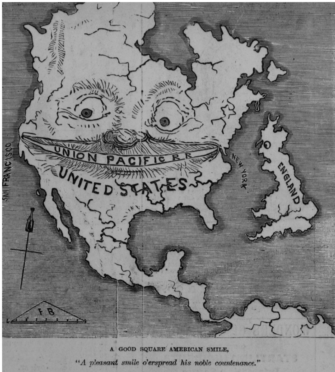
"A Good Square American Smile" Frank Leslie's Illustrated Newspaper, June 5, 1869