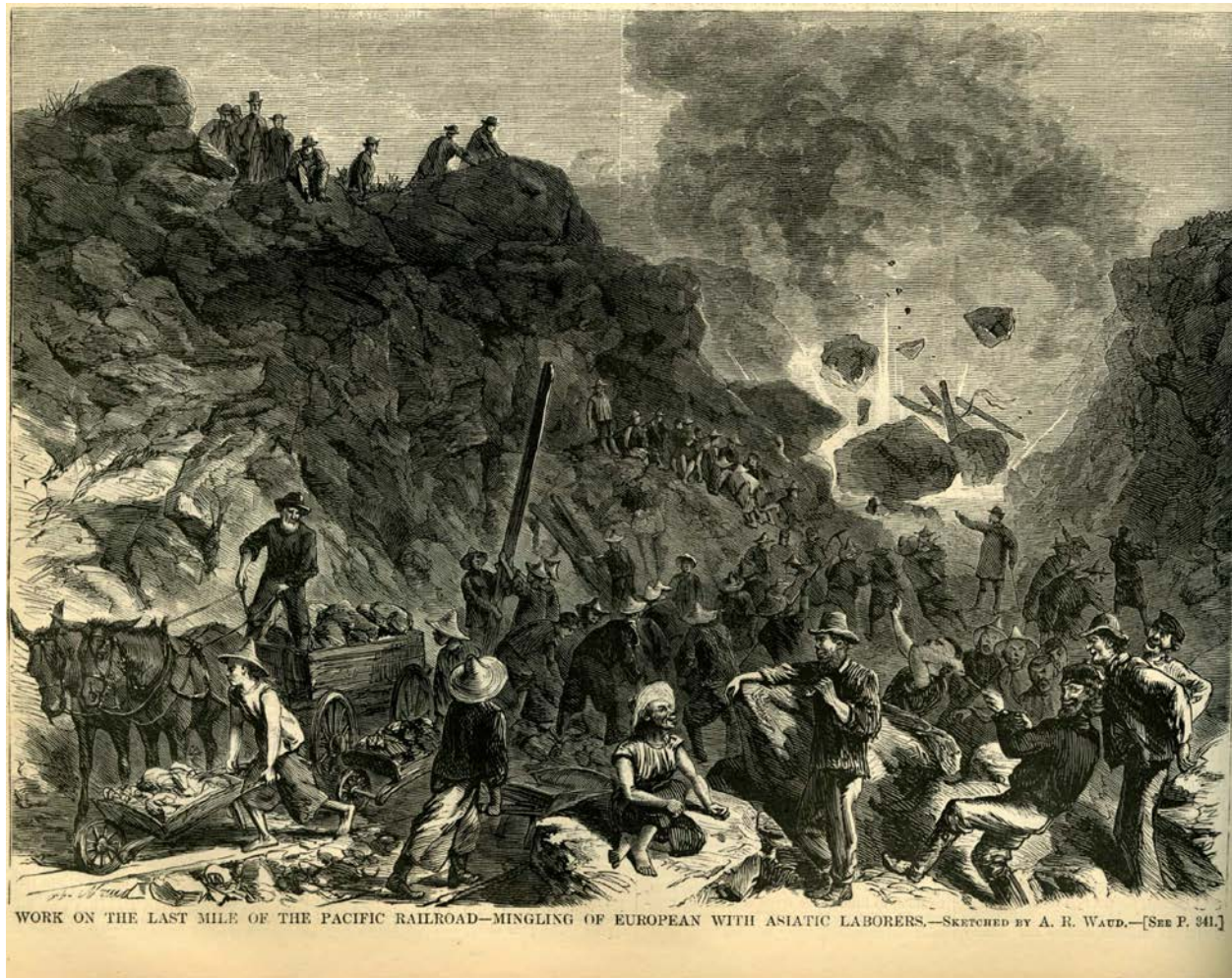
“Work on the Last Mile of the Pacific Railroad—Mingling of European with Asiatic Laborers,” sketched by Alfred R. Waud, Harper’s Weekly, May 29, 1869.