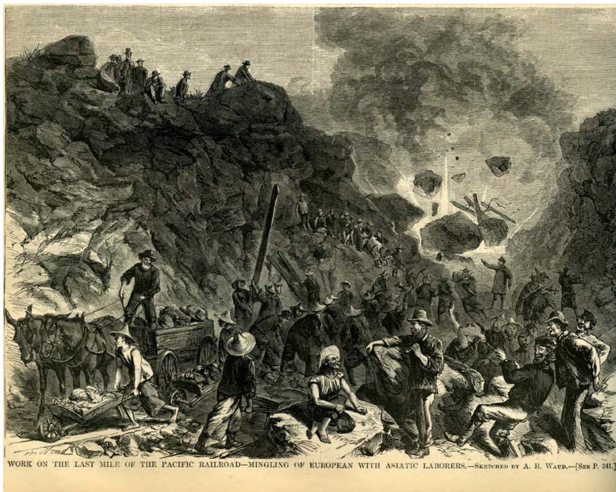
“Work on the Last Mile of the Pacific Railroad—Mingling of European with Asiatic laborers,” sketched by Alfred R. Waud, Harper’s Weekly, May 29, 1869.