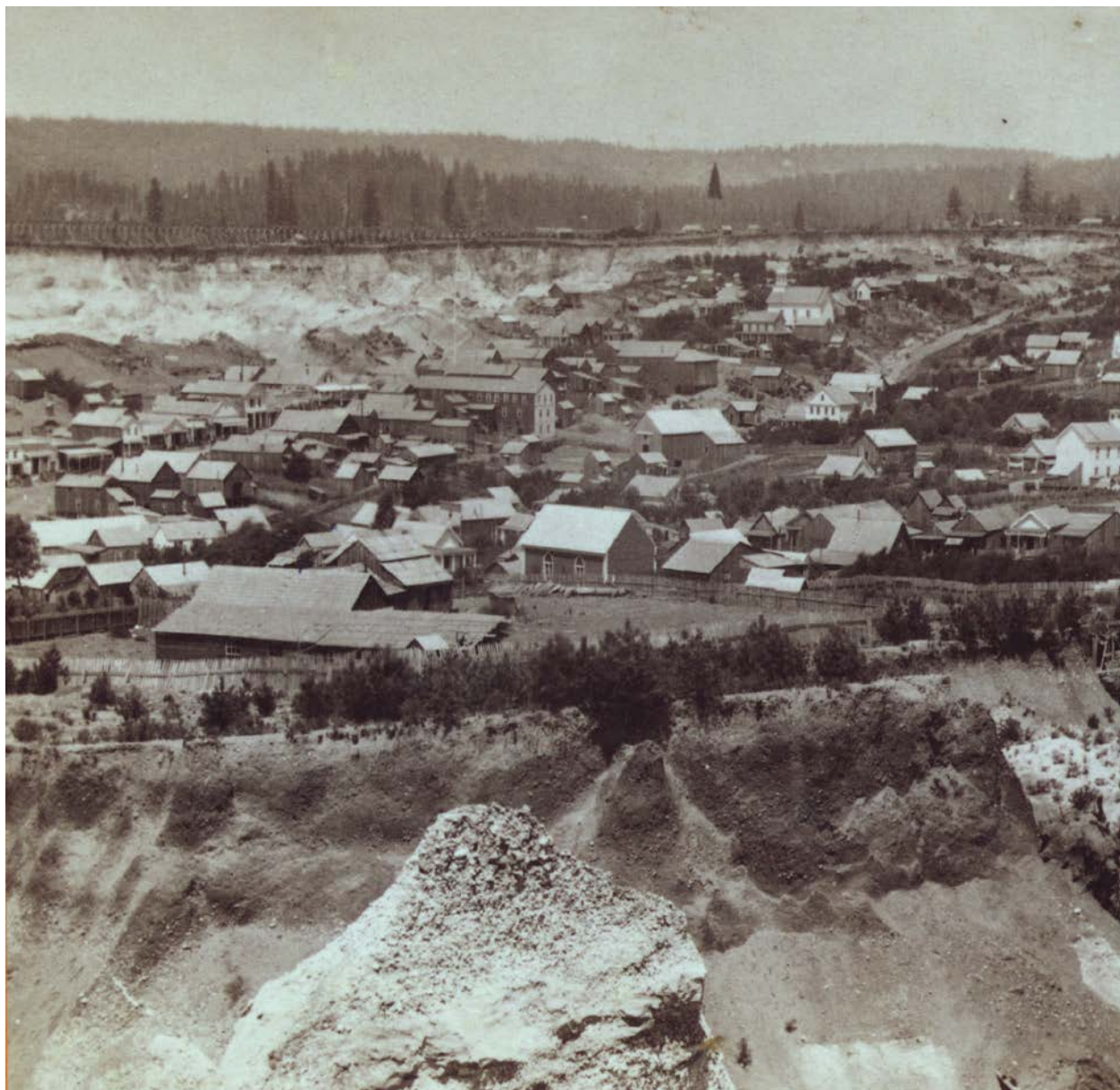
“Dutch Flat, Placer County. 67 miles from Sacramento,” photograph by Alfred Hart, ca. 1865–1869. (Library of Congress Prints and Photographs Division, LC-USZ62-56969)