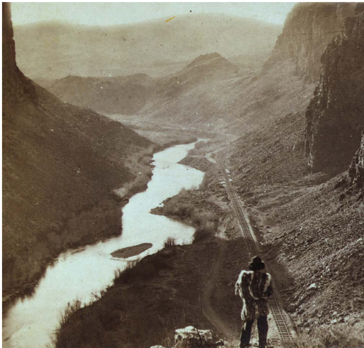
"Indian viewing railroad from top of Palisades. 435 miles from Sacramento," by Alfred Hart, ca. 1865–1869 (Library of Congress Prints and Photographs Division, LC-USZ62-50744)