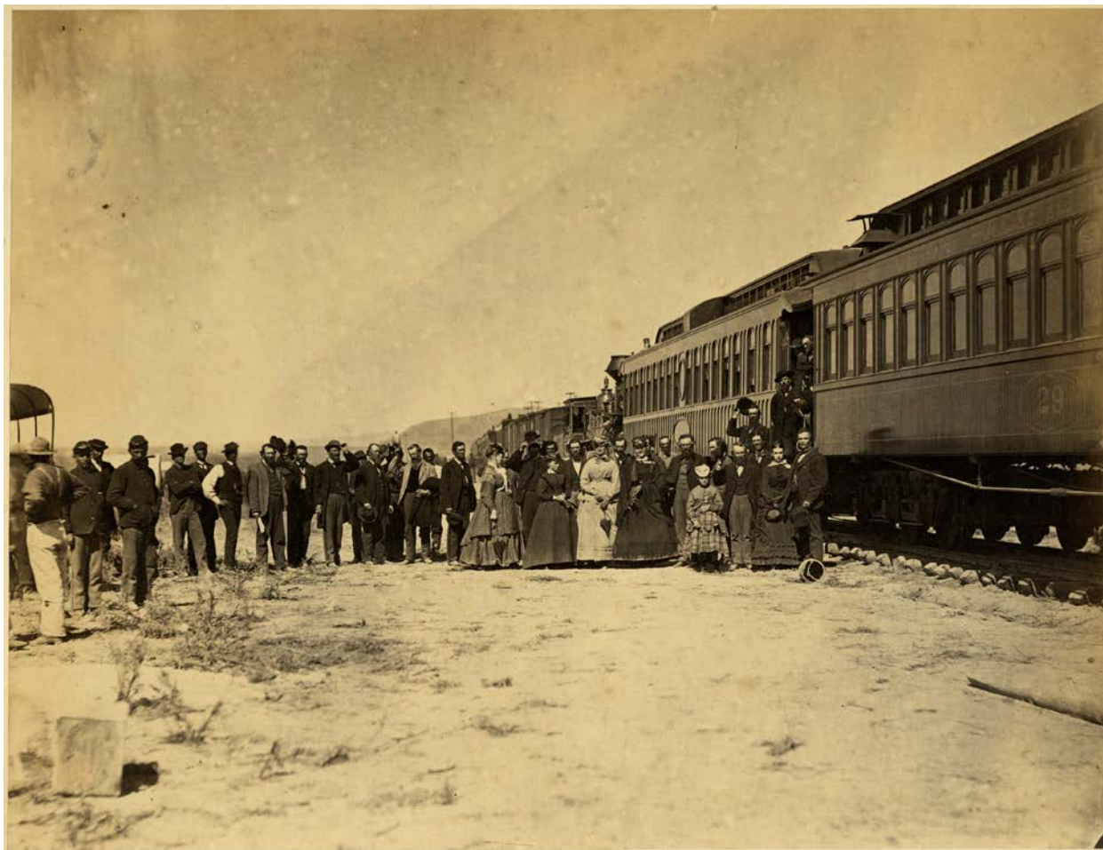
Union Pacific Railroad officers at Promontory Point, Utah, May 10, 1869