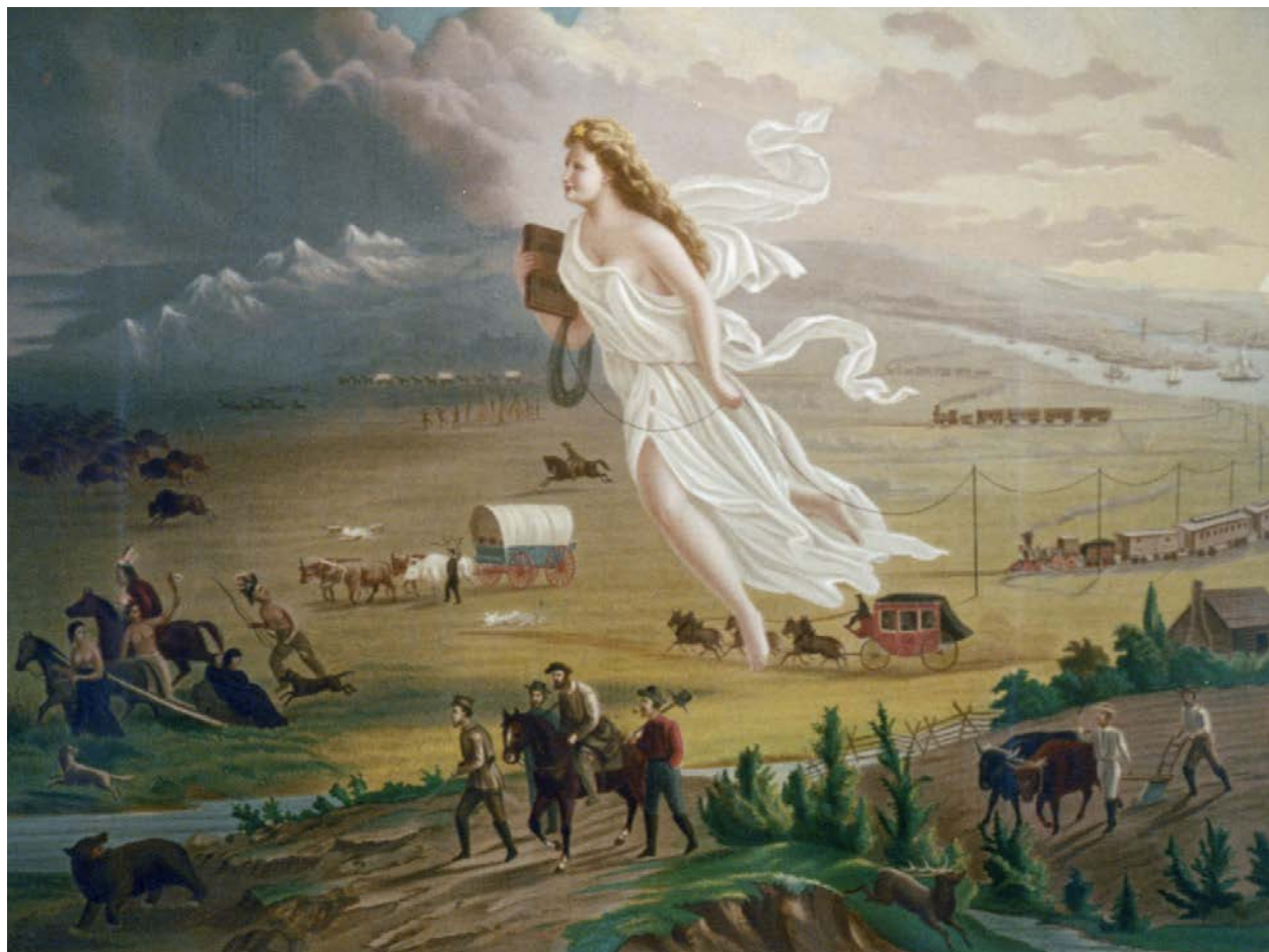
"American Progress: Westward the Course of Destiny," by George A. Crofutt after a painting by John Gast, 1873