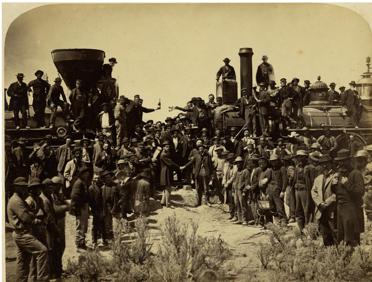
Joining of the Rails, Promontory Summit, Utah, May 10, 1869