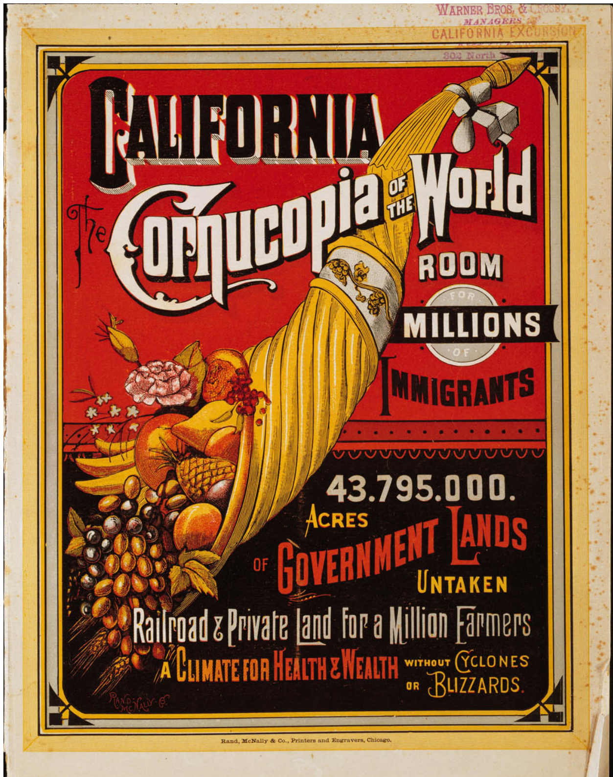
"California -Cornucopia of the World."