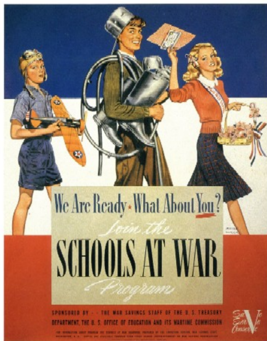
Citation: Nurick, Irving. 1942. We are ready, what about you? join the schools at war program. [Washington, D.C.]: U.S. G.P.O. © 2013 The Gilder Lehrman Institute of American History www.gilderlehrman.org