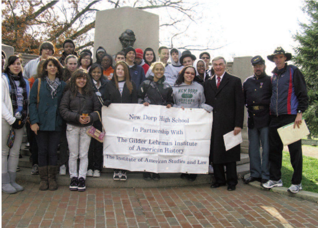
Students from New Dorp High School in NY speak with journalist Sam Donaldson on the battlefield at Gettysburg.

The Gilder Lehrman Affiliate Schools Program promotes teacher development and innovation in history teaching. The Institute provides Affiliate Schools with a unique online gateway to education resources, events, and tools designed to bring American history to life in the classroom. The first Gilder Lehrman History School, the Academy of American Studies in Queens, NY, was founded in 1994. We currently have 635 Affiliate School members in forty-three states—stage one of a major initiative to expand the affiliate school program in the 2009-2010 school year, thanks to a generous grant from the NEH.