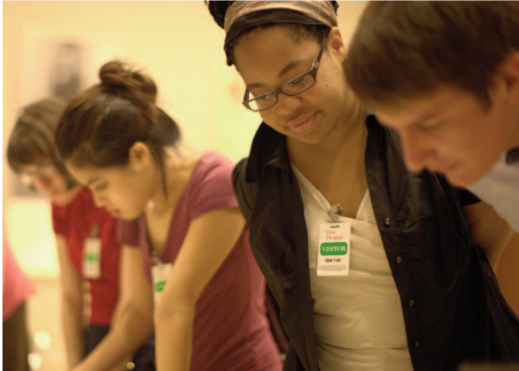
2010 Gilder Lehrman History Scholars examine documents from the Gilder Lehrman Collection.

For eight years, the Gilder Lehrman Institute has sponsored a competitive summer scholarship program in American history for outstanding college sophomores and juniors. The program, conducted in New York City, provides an opportunity for the next generation of historians to experience primary-source research and to work closely with eminent scholars. In addition to the five-week History Scholars Program, there is a one-week version for thirty finalists. Since 2003, nearly 400 college students have been awarded places in the program from among more than 1500 applicants.